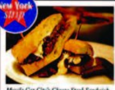
Muscle Car City's Cheese Steak Sandwich